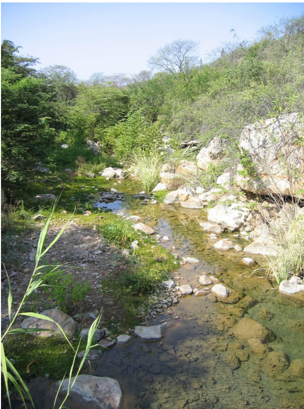
Figure 1. Stream along which Hyloxalus elachyhistus occurs at Chaparri.

The advertisement call of H. azureiventris has a shorter note duration (32.57 vs. 100 ms) and shorter intervals between notes (46.95 vs. 75 ms) than that of H. elachyhis-