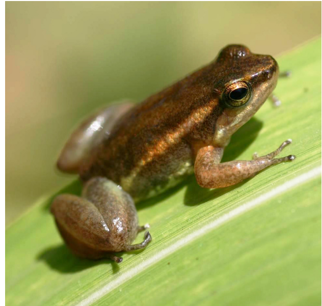
Figure 2. Hyloxalus elachyhistus in life (call voucher ZFMK 85034, SVL 19 mm).